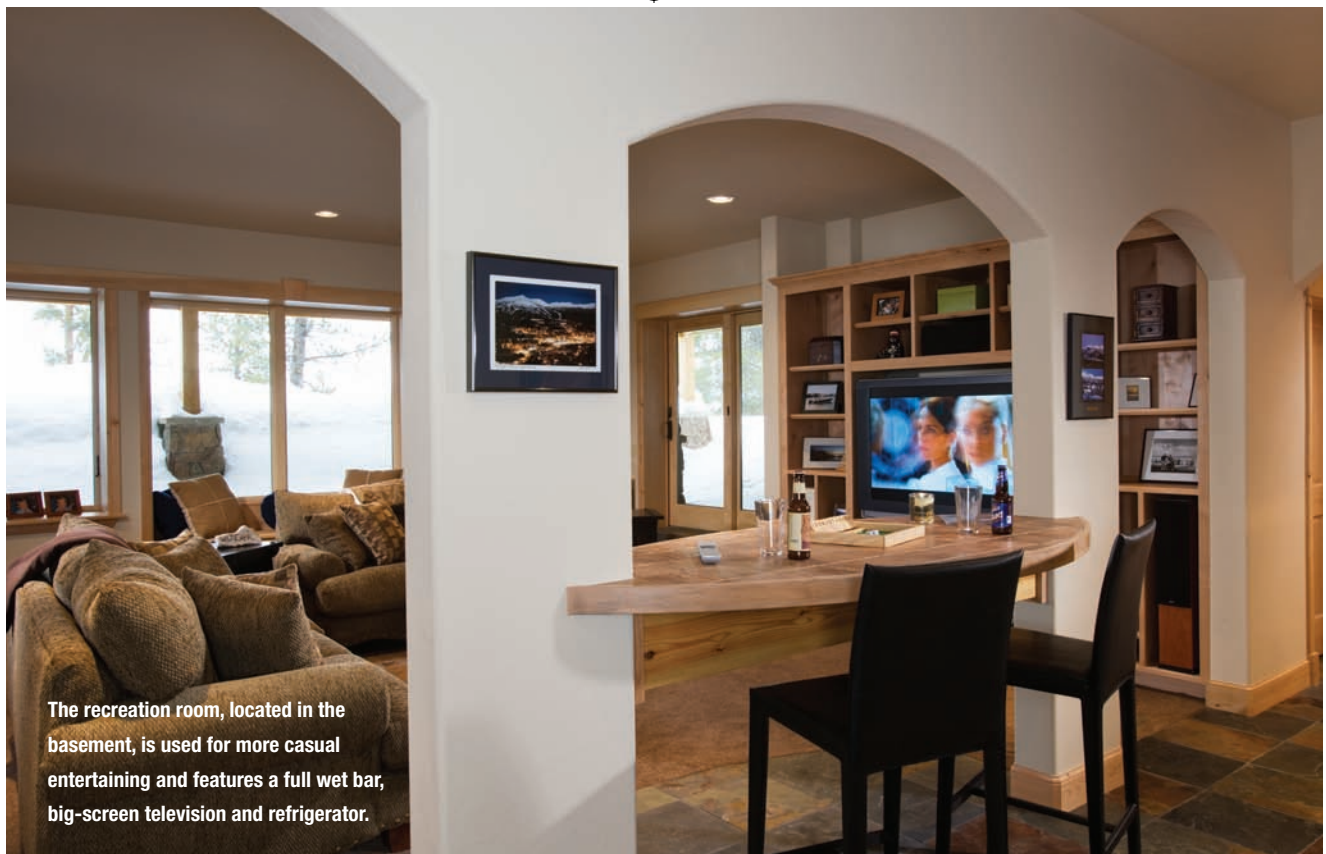
The recreation room, located in the basement, is used for more casual entertaining and features a full wet bar, big-screen television and refrigerator.

reason, having a mudroom (and a garage) to store and shed clothing and gear is critical. “When you come into the house, we wanted to just be able to drop everything and go in and get warm,” Sands explains.