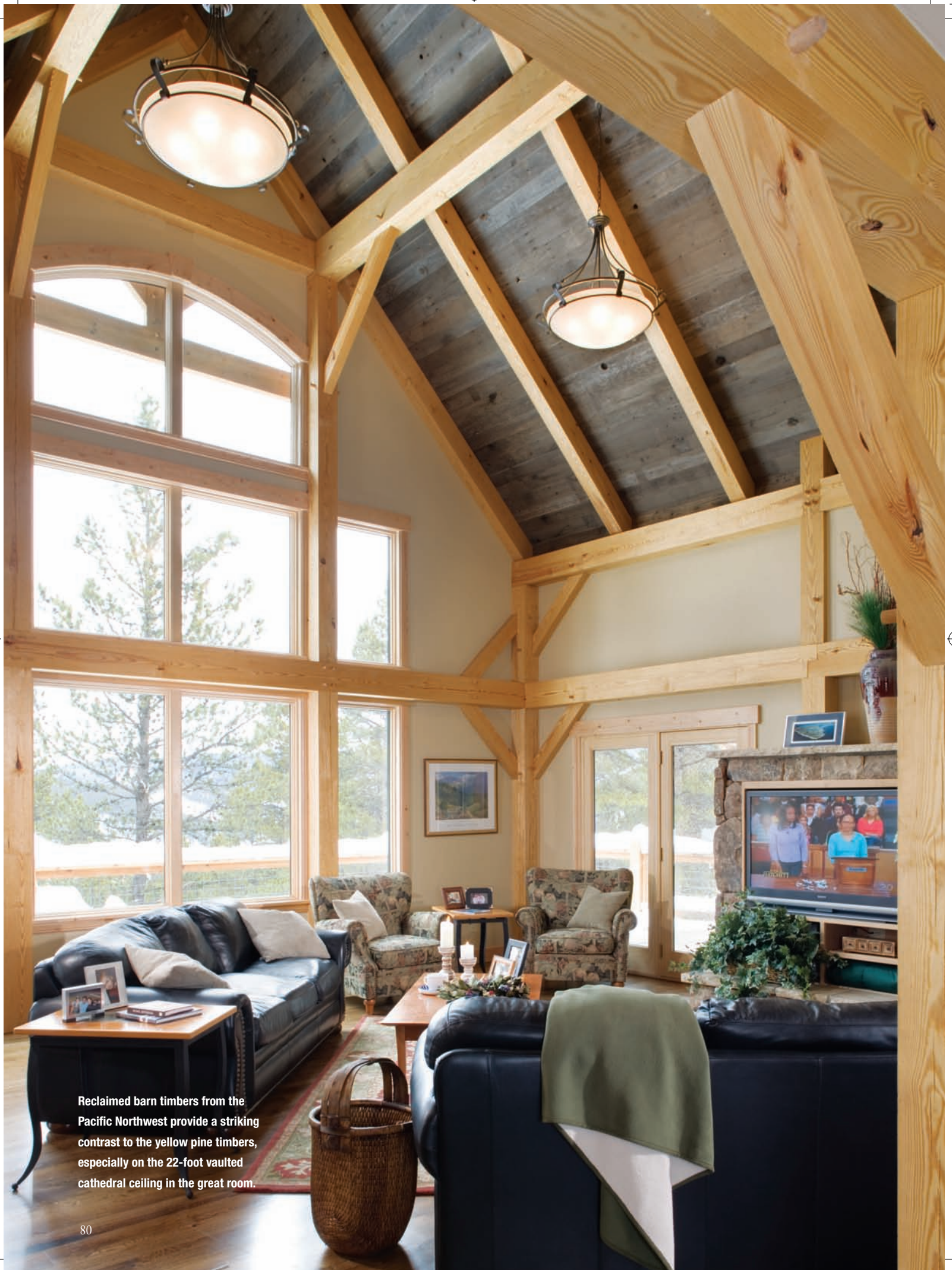
Reclaimed barn timbers from the Pacific Northwest provide a striking contrast to the yellow pine timbers, especially on the 22-foot vaulted cathedral ceiling in the great room.