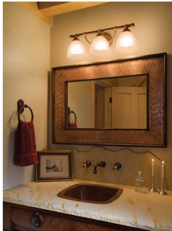
LEFT: The children's play area is outfitted with a couch, child-sized sitting chairs, a television, play tables, book shelves and toy chests. ABOVE: The powder room, designed around a copper mirror that the Paynes already owned, features an antique dresser converted into a vanity and topped with a marble counter and copper sink.